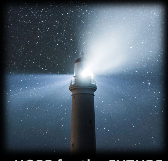
HOPE for the FUTURE